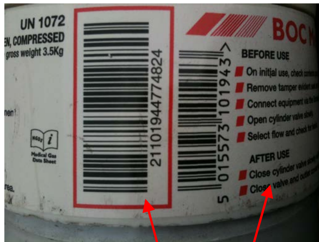
Figure 2 BOC Cylinder bar code label

BOC cylinders carry bar codes which largely conform to the processes described in this guideline. However there is some ambiguity in the way that the GS1 standards have been interpreted. This section clarifies how to interpret the BOC bar codes.