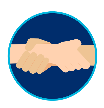
We are supporting 33 Acute Trusts as part of the Global Digital Exemplars programmes