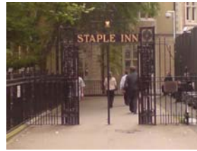
Proceed down Staple Inn and pass through the iron gates. At the end of the railings turn left into Staple Court.