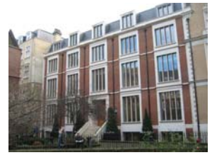
Descend down the steps and proceed straight to the entrance of 11, Staple Inn Buildings (on your right), keeping the garden to your left.