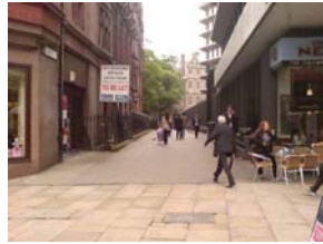
Staple Inn runs between Cafe Nero and Chop'd, directly outside Chancery Lane tube station which is on the south side of High Holborn.

GS1 UK Staple Court 11 Staple Inn Buildings London WC1V 7QH T +44 (0)20 7092 3500 F +44 (0)20 7681 2290 www.gs1uk.org